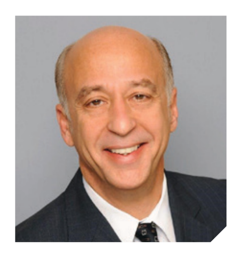
US - NEW YORK